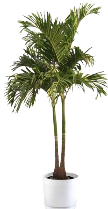
8 - 10ft Andonidia Palm

*Discount pricing only applies to orders received and paid in full thirty days prior to Exhibitor Move In