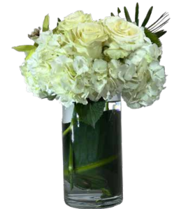
V 16-18" tall x 10" wide $150.00 each