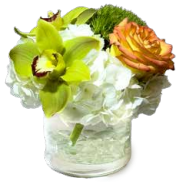
K 8" tall x 8" wide $85.00 each

PROFESSIONAL FLORAL DESIGNS A-Z: ORDER ON PAGE 6