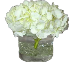
G3 6" tall x 5" wide $50.00 each