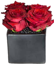
C 6" tall x 5" wide $60.00 each