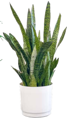
2 - 3ft Snake Plant