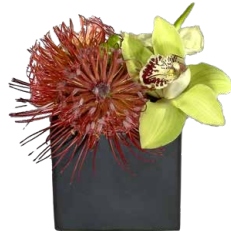
D 6" tall x 5" wide $65.00 each