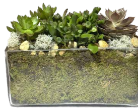
I2 7" tall x 7-8" wide $85.00 each