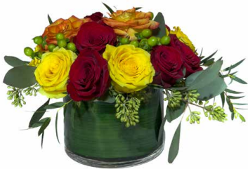
O 12" tall x 12-14" wide $125.00 each