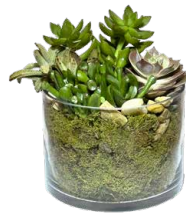
I1 7" tall x 5-6" wide $85.00 each