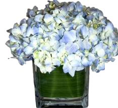
G2 6" tall x 5" wide $50.00 each