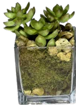
F2 6" tall x 4" wide $45.00 each