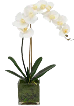
J 6-18" tall x 10" wide $95.00 each

Please note seasonal adjustments may apply to the above arrangements.