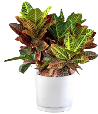
2 ft Croton