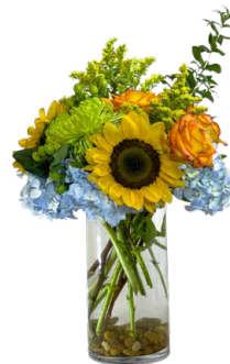
U 16-18" tall x 8" wide $135.00 each