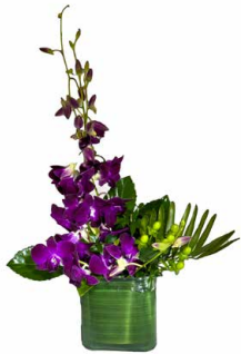
S 16-18" tall x 6" wide $95.00 each