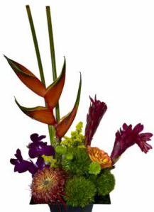
W 18-20" tall by 12" wide $135.00 each