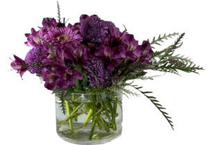
N 12" tall x 10-12" wide $95.00 each