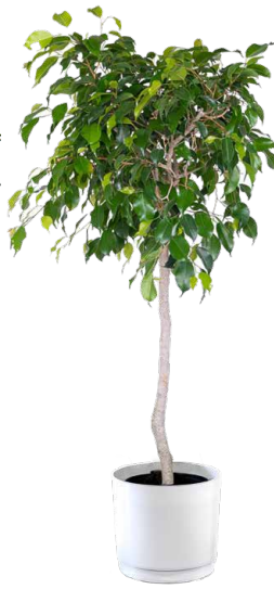
5 - 6ft Ficus Tree