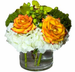
R 14-16" tall x 6" wide $135.00 each