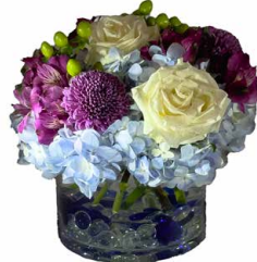
P 12" tall x 10-12" wide $125.00 each