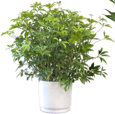
2 ft Arb