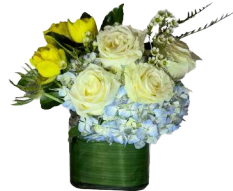
L 12" tall x 10-12" wide $85.00 each