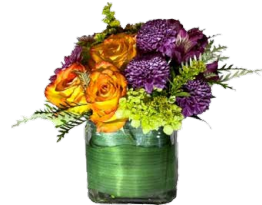
M 10" tall x 10" wide $95.00 each