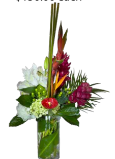
Z 20-24" tall x 16-18" wide $175.00 each

Please note seasonal adjustments may apply to the above arrangements.