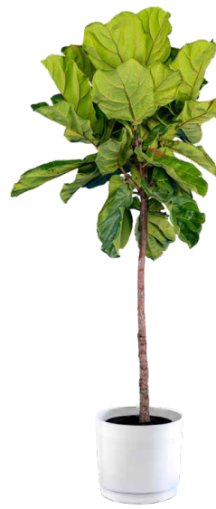
5 - 6ft Fiddle Fig Tree