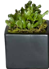
F1 6" tall x 4" wide $45.00 each