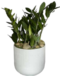
H 10-14" tall x 5-6" wide $65.00 each