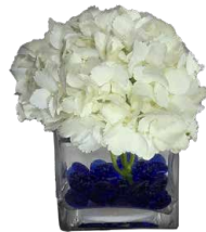
G1 6" tall x 5" wide $50.00 each