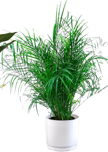
2 - 3ft Palm