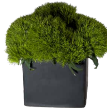
E 6" tall x 5" wide $65.00 each