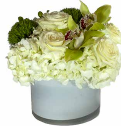
Q 12" tall x 10-12" wide $135.00 each