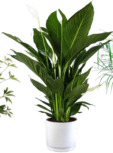
2 - 3ft Spath